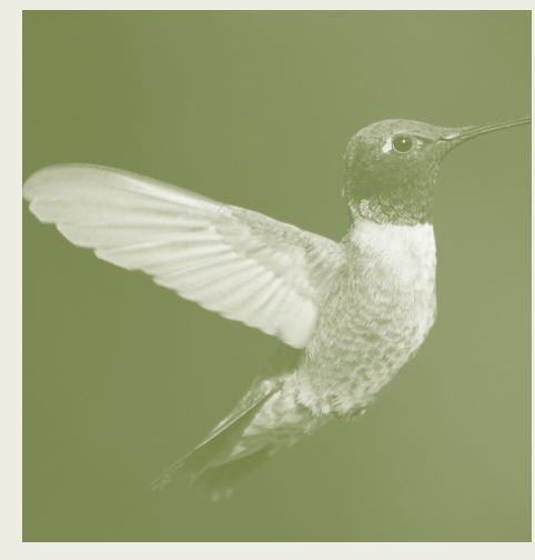
Black-chinned Hummingbird, a summer species in the Thompson-Okanagan Plateau ecoregion.