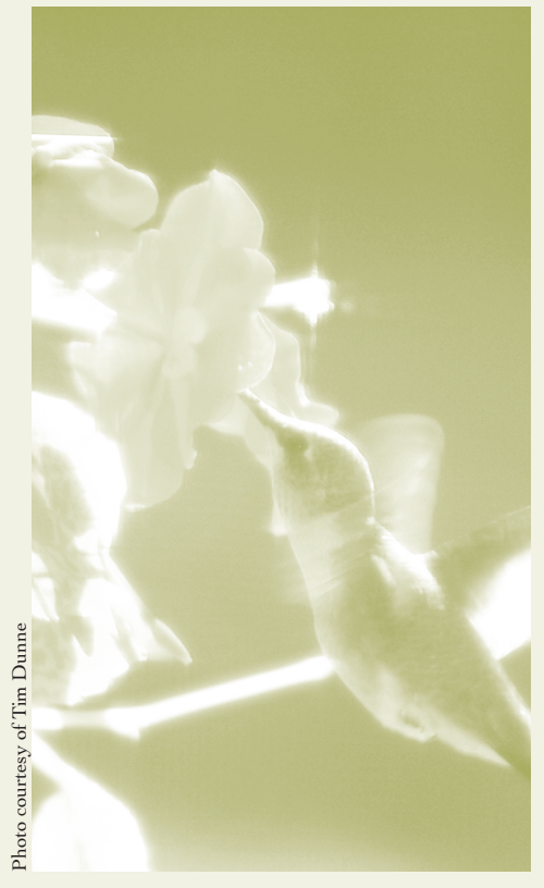
Ruby-throated Hummingbird, a summer species in the St. Lawrence Lowlands ecoregion.