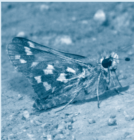
Juba Skipper butterfly.