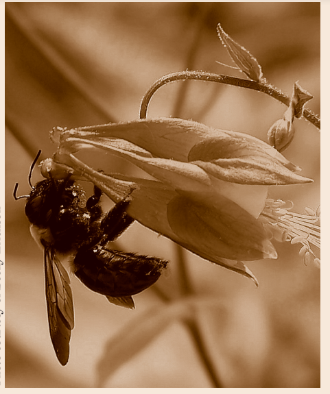
A bee foraging on a Columbine flower in Missouri.