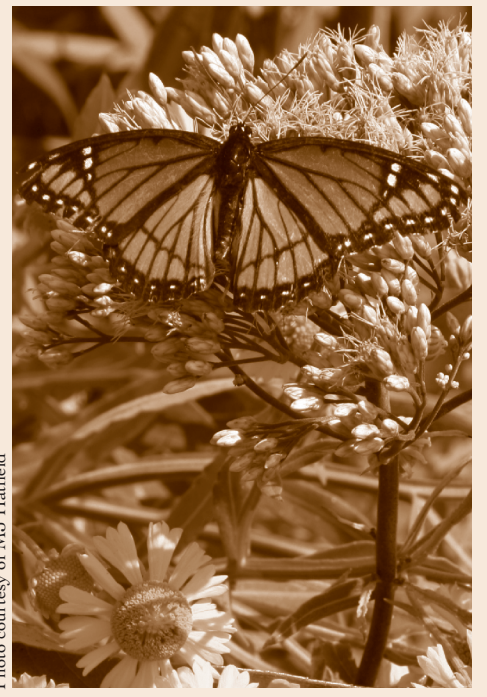
A Viceroy butterfly pollinating Joe Pye weed, native to Iowa.