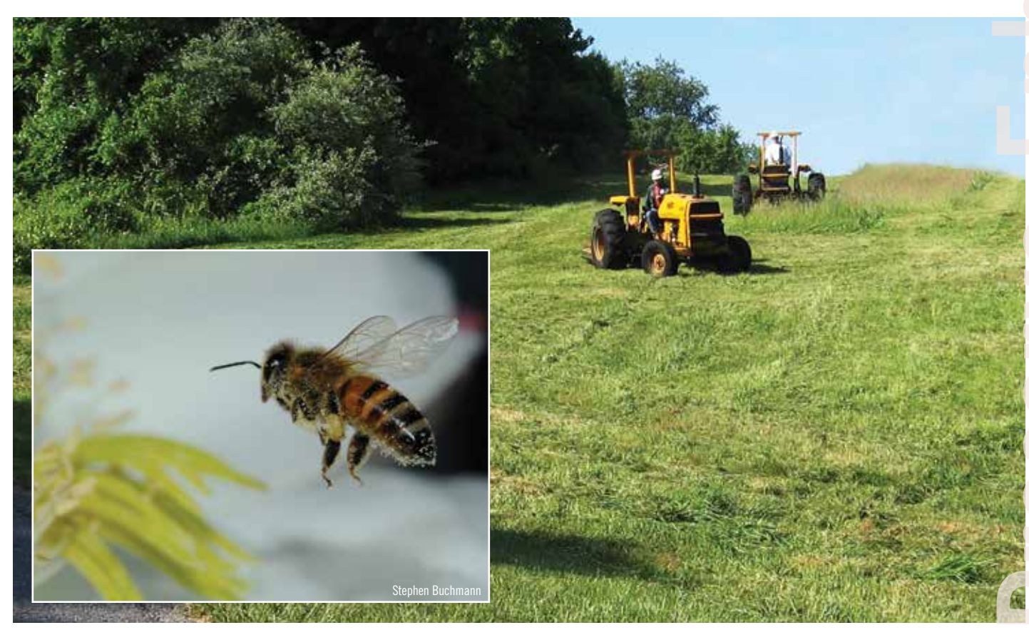
Planting Forage for Honey Bees in Canada: A guide for farmers, land managers, and gardeners

Farm land provides excellent opportunity for providing honey bee forage and bee habitat through preservation. Preservation of riparian vegetation, hedgerows, and meadows in marginal land can be a win-win because these areas can provide forage for honey bees, enhance native bee populations that aid crop pollination, and provide resources for natural enemy insects that prey on pests.