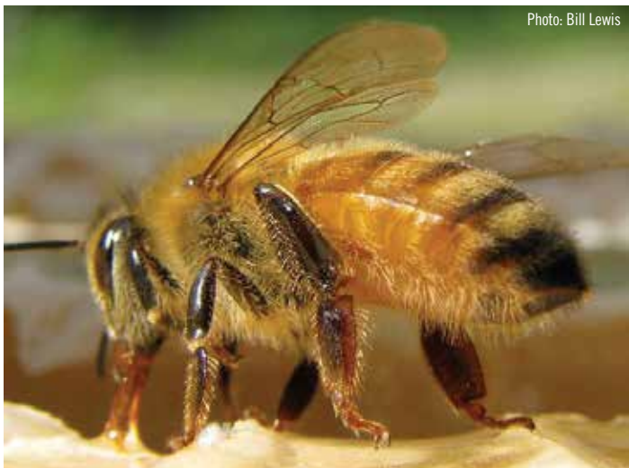
Worker Honey Bee Life Cycle