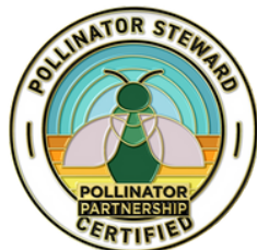
PSC lapel pin

4. Once both forms have been submitted and approved, you will receive a certificate of completion, and the authority to use the Pollinator Steward stamp as part of your correspondence and pollinator-related activities. You will be eligible to receive a free PSC lapel pin (seen below) once certified. The pin is great to wear anytime as a conversation starter and for outreach events.