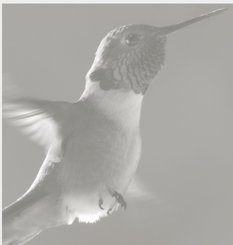
Rufous Hummingbird , a year-round species in the Okanagan Highlands ecoregion.