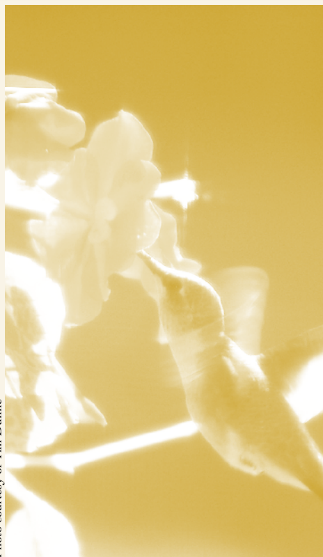
Ruby-throated Hummingbird, a summer species in the Lake Manitoba Plain ecoregion.