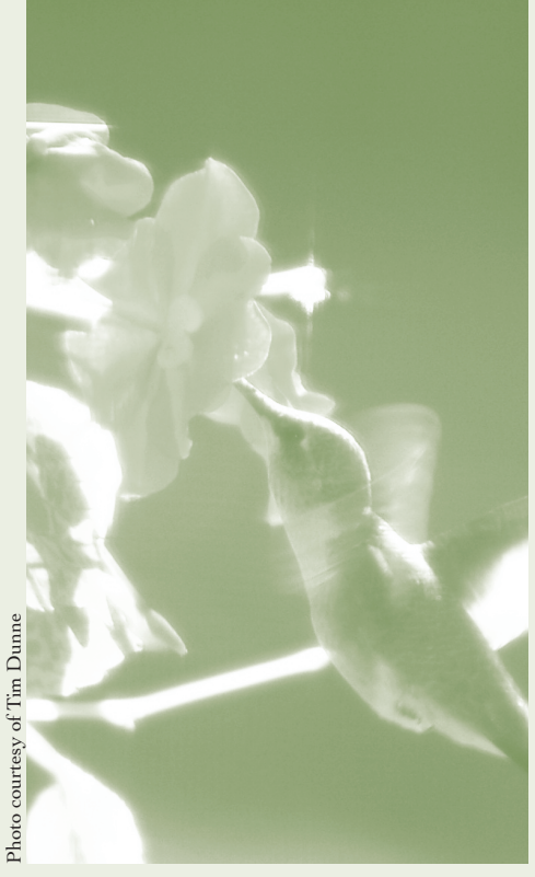
Ruby-throated Hummingbird, a summer species in the Lake Erie Lowlands.