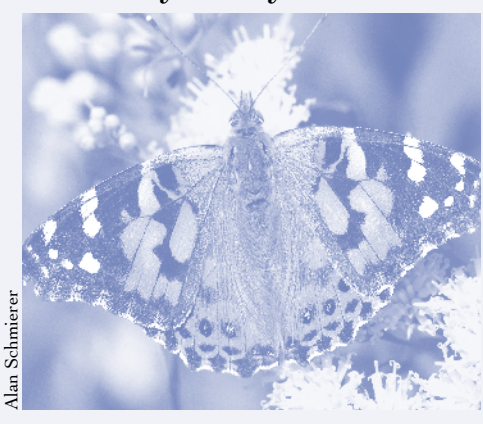
Painted Lady butterfly

The Rufous Hummingbird, a migrating species within the Great Plains - Palouse Dry Steppe Province.