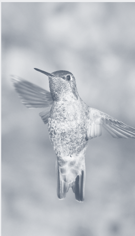
Anna's Hummingbird, a summer species in the Georgia-Puget Basin ecoregion.