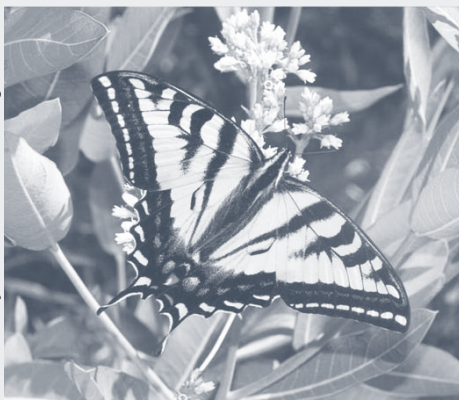
Western Tiger Swallowtail.