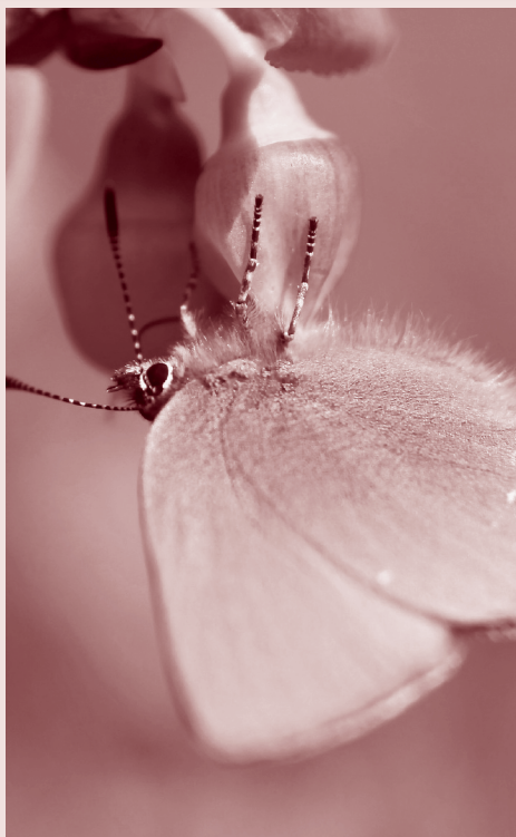
Green hairstreak butterfly.