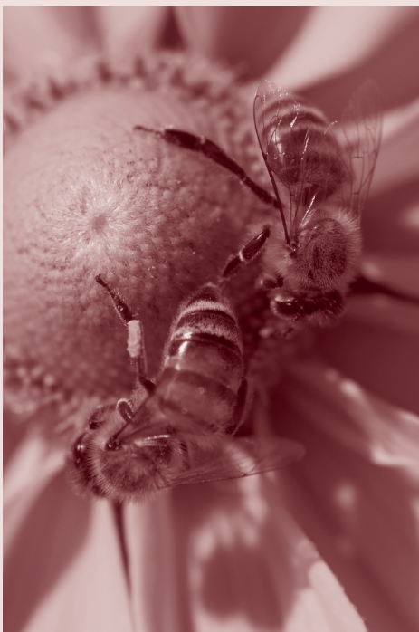
Two bees at a flower.