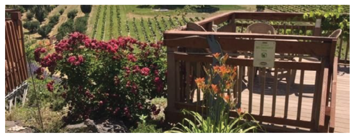
Bee Friendly Farming® winery with various flowering plants

4. Provide permanent habitat for nesting through features such as hedgerows, natural brush, buffer strips, or bare ground.