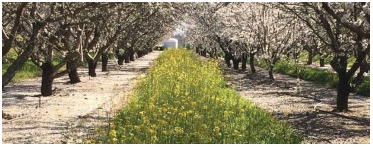
Cover crop in almonds

2. Provide bloom of different flowering plants throughout the growing season, especially in early spring and late autumn. There is no minimum land coverage for seasonal bloom. During the growing season, it is important to provide pollinators with alternate food sources that offer a complete diet. Both commercial honey bees and native pollinators benefit when provided with diverse food sources.