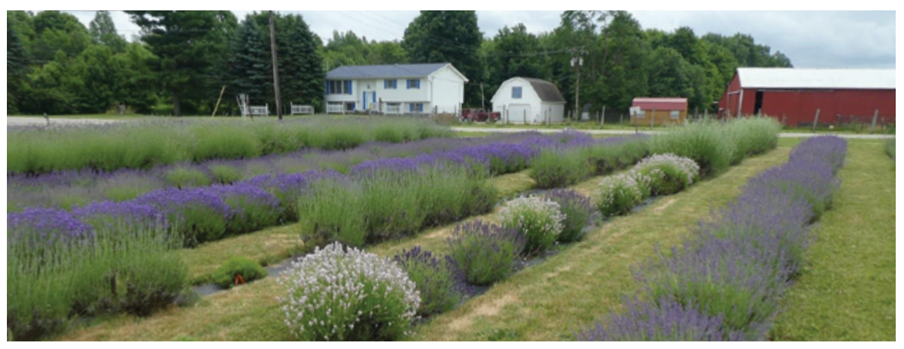
Various pollinator friendly perennial plants

1. Offer forage providing good nutrition for bees on at least 3% of land. Forage includes cover crops, if they are left to bloom. Pollinators require year round food and habitat other than crops. By planting flowering plants that produce nectar and pollen, we can support our pollinators year round.