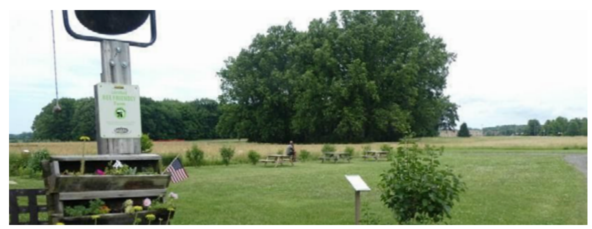
Demonstration area of BFFC with variety of plants