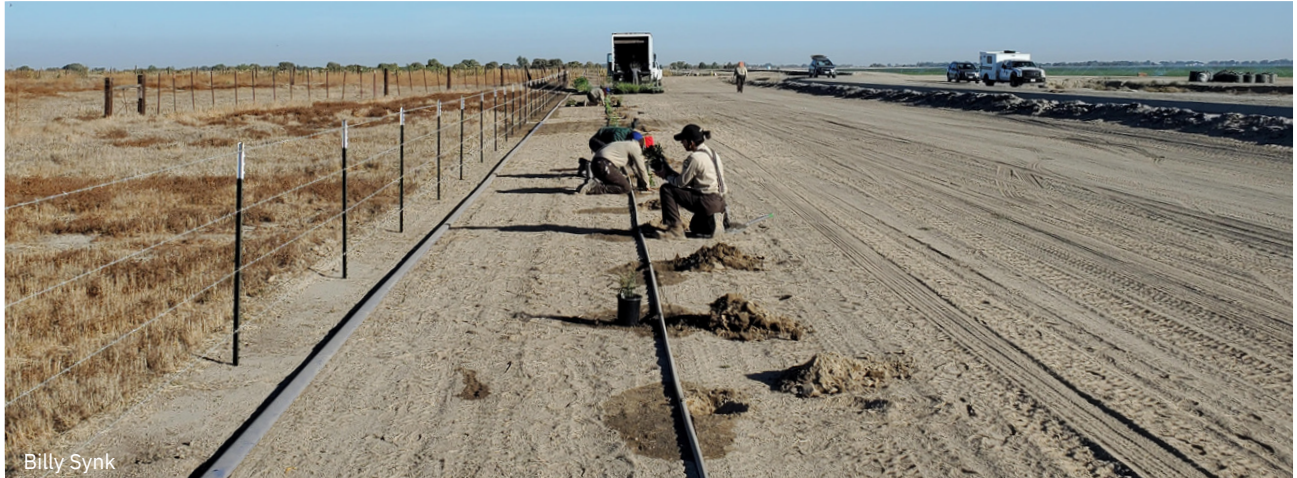
Establishment of hedgerow along Bee Friendly Farm

3. Provide permanent habitat for nesting through features such as, but not limited to hedgerows, natural brush, buffer strips, or undisturbed bare ground.