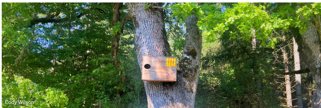
Owl box installed along vineyard for pest management

Many insecticides negatively impact pollinators and have led to a dramatic decline in insect populations over the last century. With this in mind, it is important to develop IPM programs that take into consideration the farmer's needs and pollinator health. BFF Certified farmers are expected to practice IPM potentially reducing or eliminating the use of chemicals.