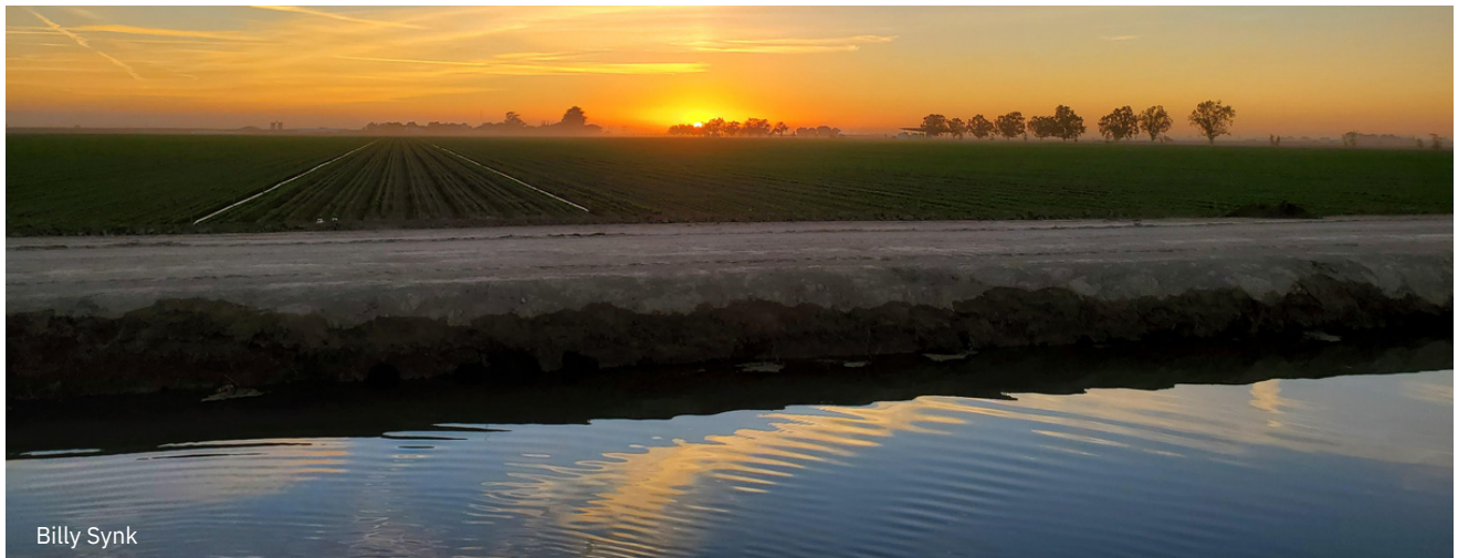
Irrigation canal providing water for pollinators

In large scale commercial farming operations, it is important to provide clean water for pollinators. Irrigation canals, holding ponds, lakes, or natural bodies of water can count for certification.