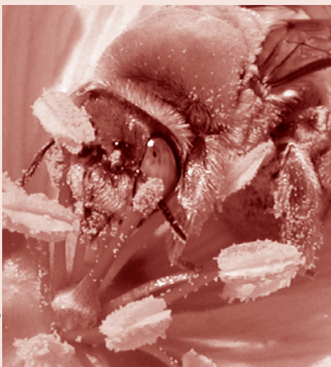
Protoxaea gloriosa bee pollinating a flower.