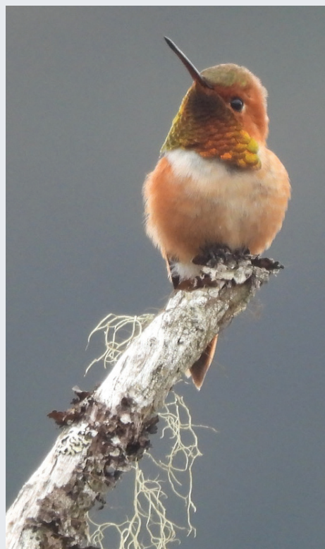
Rufous Hummingbird Selasphorus rufus