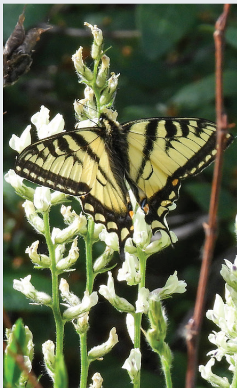
Canadian Tiger Swallowtail, Papilio canadensis