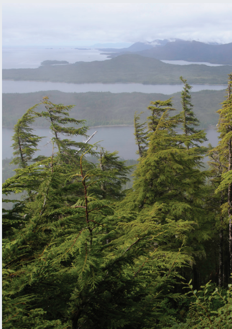
Tongas National Forest