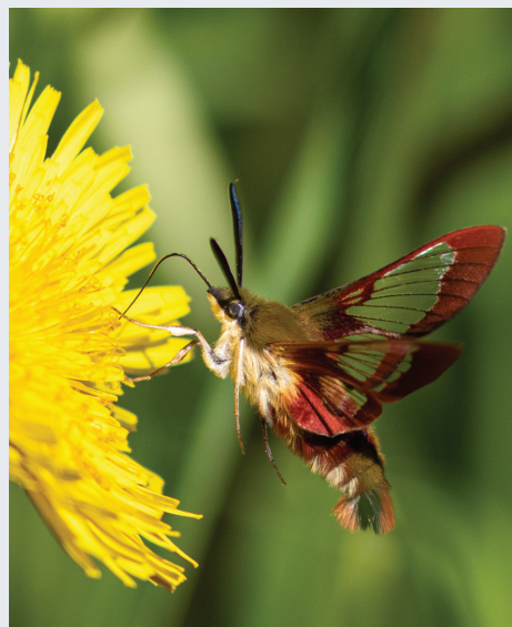
Hummingbird clearwing moth Hemaris thysbe

Though bat species in Alaska are not pollinators, bats in the southwestern United States and Mexico are important pollinators of agave and species of cactus. The head shape and long tongues of nectar bats allow them to delve into flower blossoms and extract both pollen and nectar; pollen covers their hairy bodies and is transferred as they move from plant to plant.