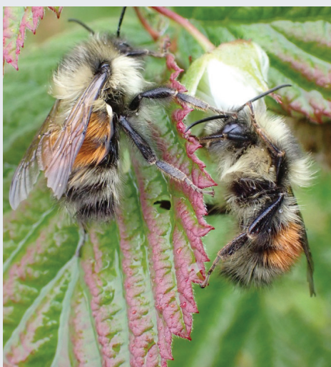
Blacktailed Bumble Bee, Bombus melanopygus