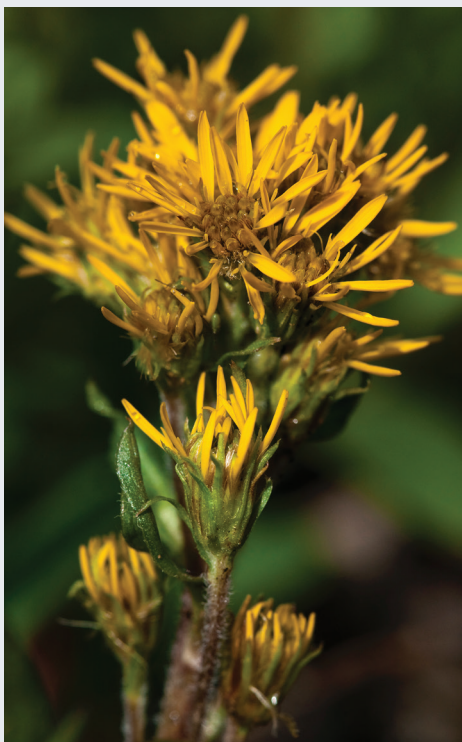
Northern Goldenrod, Solidago multiradiata

✿ The Alaska Temperate Coastal Region encompasses 7 distinct ecoregions along the Gulf of Alaska and the Bering Sea from the Alexander Archipelago in the east, the Chugach Forest in the center, to the Aleutian Islands in the west of the region.