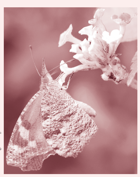
American Snout butterfly.