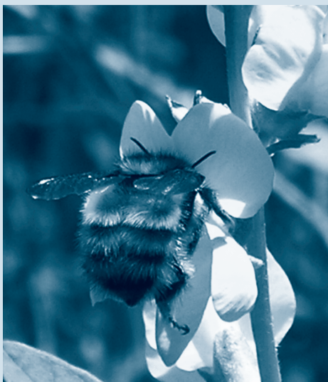
A bee foraging on a golden pea flower in Idaho.