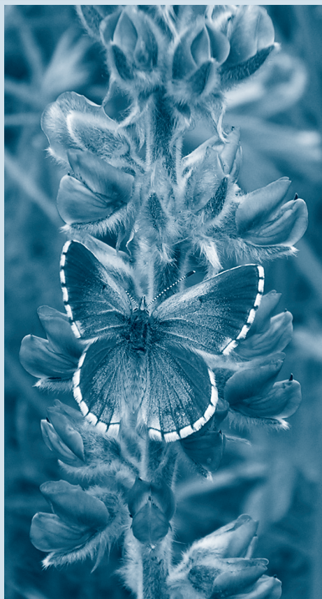
An arrowhead blue butterfly on lupine, a host plant in Idaho.