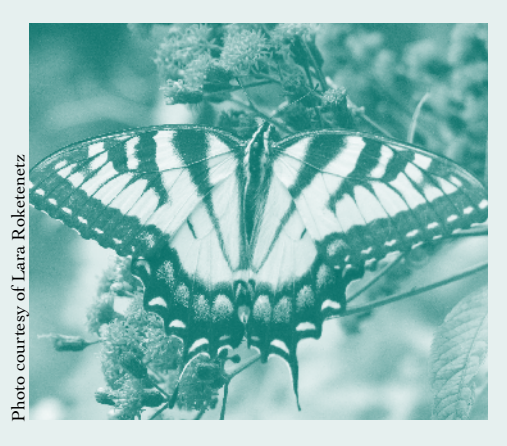
Eastern Tiger Swallowtail on Ironweed in Ohio.

Ruby-throated Hummingbird, a species frequently seen in the Eastern Broadleaf Forest.